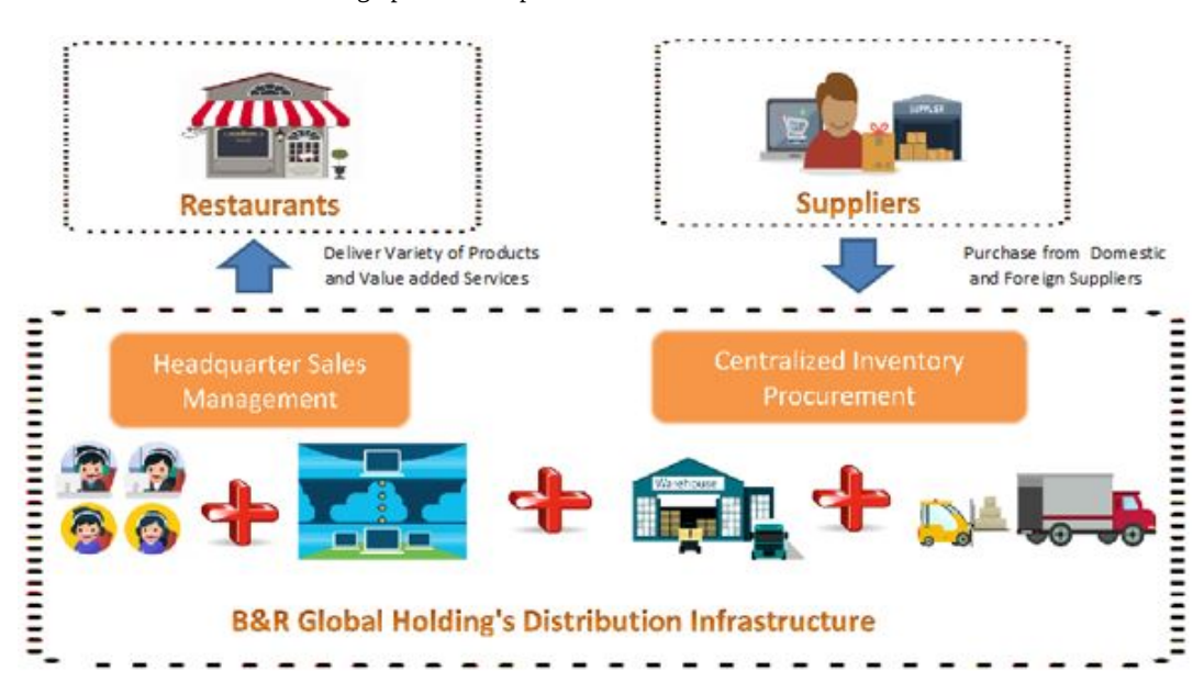
B&R Global's Business Model

The graph below depicts B&R Global's business model: