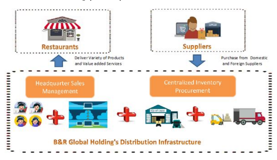
B&R Global's Business Model

The graph below depicts B&R Global's business model: